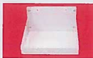
Holder for suction unit Ref. 1103.88