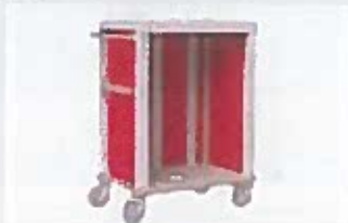
Conversion kit for telescopic drawer Eolis® Cart 600x400 Ref. 1600.50

EQUIP YOUR EMERGENCY CART WITH TELESCOPIC DRAWERS: