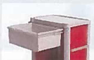
Drawer 3 levels with telescopic slide Eolis® Cart 600x400 Ref. 1600.53