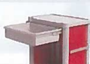
Drawer 2 levels with telescopic slide Eolis® Cart 600x400 Ref. 1600.52