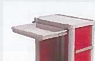
Drawer 1 level with telescopic slide Eolis® Cart 600x400 Ref. 1600.51