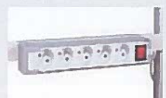
5 sockets + switch Ref. 1101.50