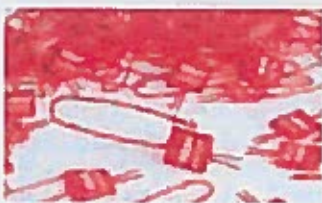
Red seals (qty 100) Ref. 1100.47