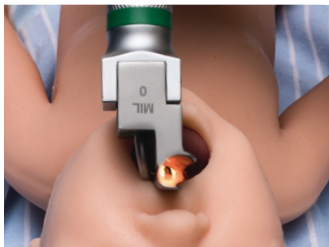
Anatomically accurate epiglottis, glottis, trachea