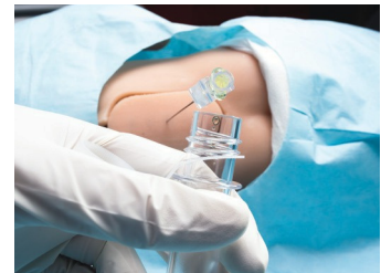
Lumbar puncture needle insertion and sampling